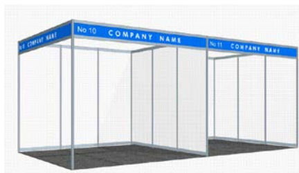
Diagram of two standard 3m x 3m shell scheme booths