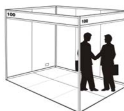
Diagram of two standard 3m x 3m shell scheme